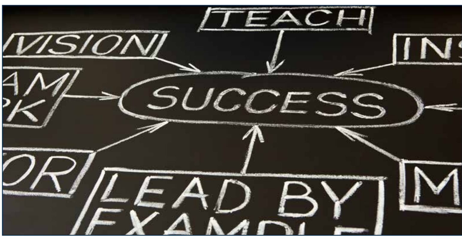
BEYOND CONVICTION RATES: MEASURING SUCCESS IN SEXUAL ASSAULT PROSECUTIONS JENNIFER G. LONG, JD AND ELAINE NUGENT-BORAKOVE<sup>1</sup>

One of the most enduring realities of sexual assault is that very few cases result in arrest, prosecution, and conviction of [perpetrators].<sup>2</sup>